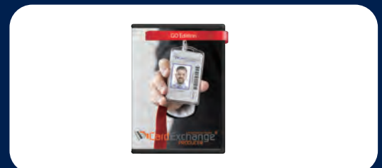
Come with professional printing software